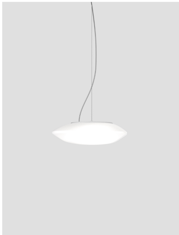
MODUL SP G BCST BO E27 CE